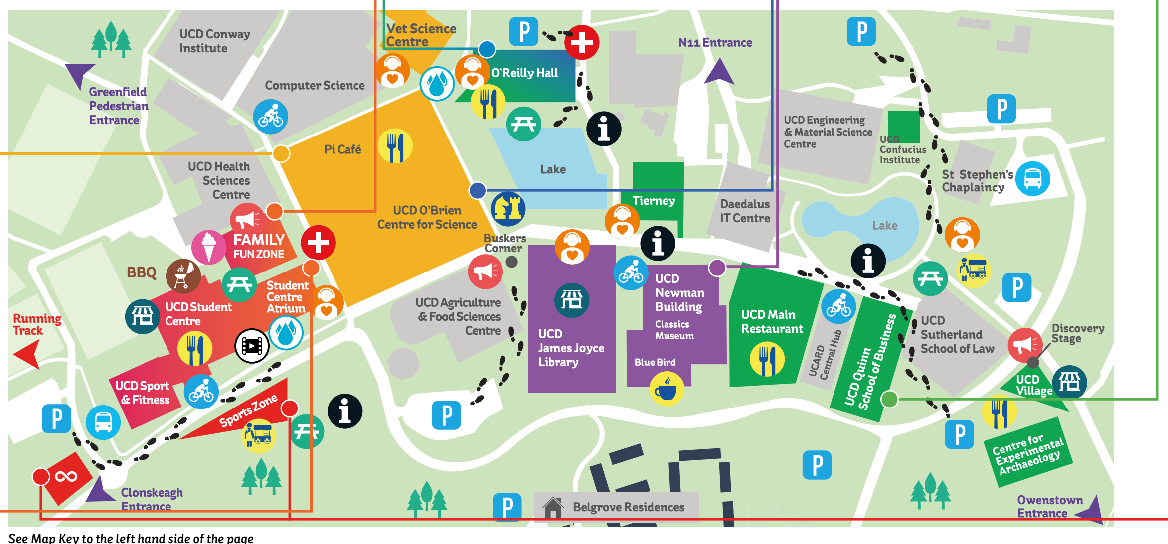
See Map Key to the left hand side of the page